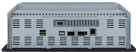
▶ Bottom view SECOM 777TCE