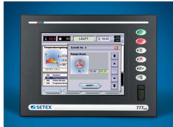
▶ SECOM 777 TCE

The SECOM 777 TCE with integrated PLC is used together with a decentral In-/Output System (FMD modules).