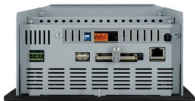
▶ Bottom view SECOM 535CE (DIOS)