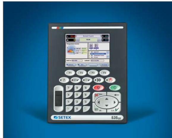
▶ SECOM 535ce

The SECOM 535ce with integrated PLC is used together with a decentral In-/Output System (FMD modules).